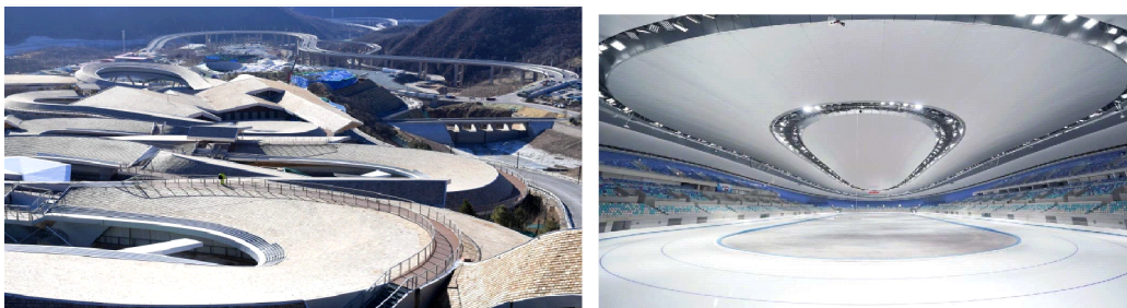
FIGURE 3 Smart Venues for 2022 Beijing Winter Olympics

Located in Beijing and Zhangjiakou City, Hebei Province, the 87 venues and the roads connecting the venues for 2022 Beijing Winter Olympics were full coverage of 5G networks. This is also the largest commercial use of 5G networks in the history of the Olympic Games. With the help of 5G network, many Winter Olympics games e.g. alpine skiing, which operated in high mountains with high-speed competitions and difficult-to-capture images are turned into visual feasts in a clear and timely manner. Many of these wonderful videos and pictures are presented through 5G live broadcast technology.