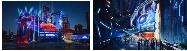
FIGURE 5 ShouGang No. 1 Furnace Paradise 26

Integrated with 5G, cloud XR, multiple layer's computing network, the traditional sports competitions are merged with modern virtual reality technology, build the century-old industrial site of ShouGang No. 1 blast furnace into the largest XR technology experience park in North China, turn the abandoned industrial site into the entrance of the universe, build the capital's high-tech cultural industry, and form 5G entertainment new benchmark. Through 5G+cloud XR technology, gamers only need to wear a lightweight head-mounted display device to enter the metaverse venue and experience the subversive and innovative immersive experience.